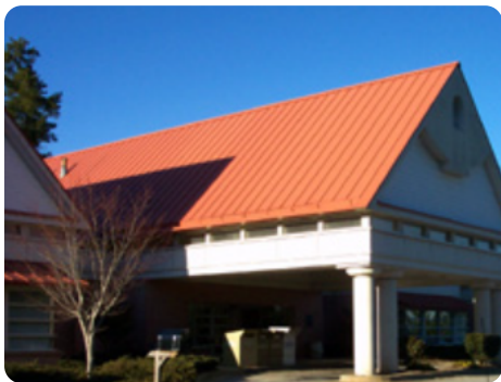
BLACKSHEAR PLACE LIBRARY