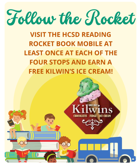
KILWIN'S ( READING ROCKET SCHEDULE )