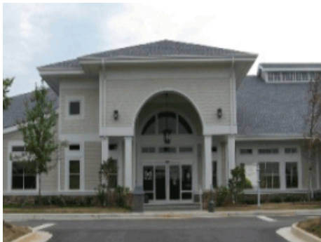
SPOUT SPRINGS LIBRARY