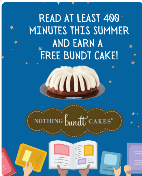
NOTHING BUNDT CAKES